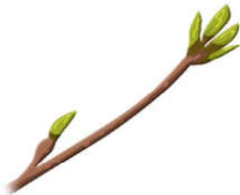
Buds On A Tree