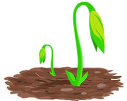
Plants Poking Throught The Soil