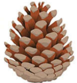
A Pine Cone